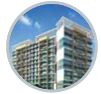
Residential & Small Businesses