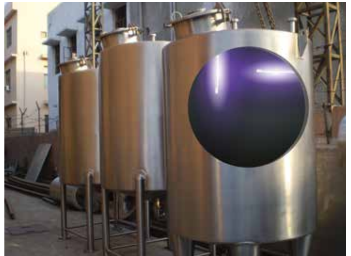
Air, surface, tank wall disinfection - tank headspace installation