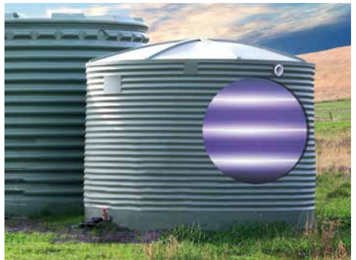
Liquid disinfection – submerged installation